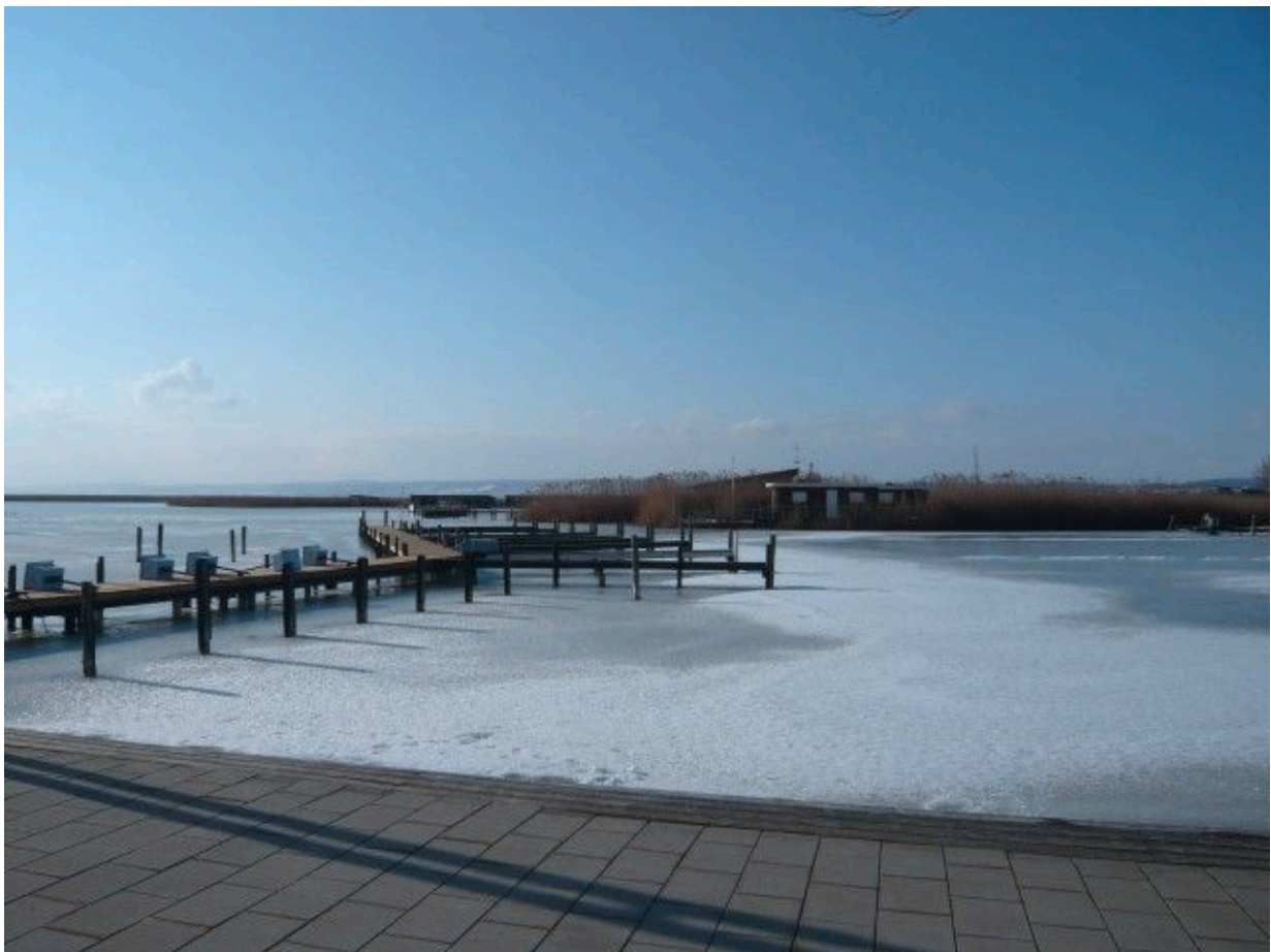
The lakeside `Neusiedler See` at Mole West in Neusiedl am See. Feb.21st 2013

EACEA – Lifelong Learning Programme ERASMUS INTENSIVE PROGRAM “PERMACULTURE DESIGN COURSE – THE CITY OF THE FUTURE”