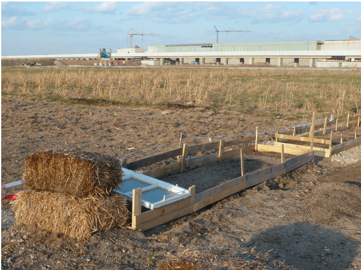
Aspern Seestadt, March 2012 * The subway U2, first buildings under construction, urban gardening

EACEA – Lifelong Learning Programme ERASMUS INTENSIVE PROGRAM “PERMACULTURE DESIGN COURSE – ASPERN SEESTADT”