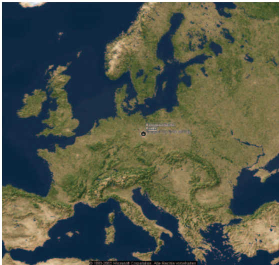
Fig 1: European soil resources. Soils and their different natural qualities are fundamental to land uses and functions in providing ecological services. European soils are under pressure by non-sustainable landuse practices. Understanding the varying properties of the soil (and water) systems in space and time that determine the opportunities for more eco-efficient land uses is essential for future integrated resource management policies.

Soils as a natural resource perform a number of key environmental, social and economic functions. Agriculture and forestry depend on soil for the supply of water and nutrients and for root fixation. Soils perform storage, filtering, buffering and transformation functions, thus playing a central role in the protection of water and the food chain and the exchange of gases with the atmosphere. Moreover, soil is a biological habitat, a gene pool, an element of the landscape and a cultural heritage as well as a provider of raw materials (see Fig. 1).